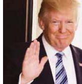
Trump: Meet with Kim could be delayed

President Donald Trump said he doesn't like the change in attitude he's picked up from North Korean leader Kim Jong Un.